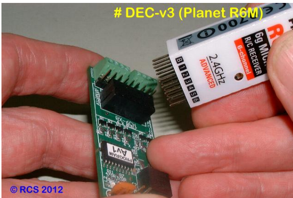
Hold one part in each hand. Carefully line up pins # 1 – 6.

This new operating program allows you to use 4 or more channel PLANET 2.4 Ghz RX's. Some plug in at right angles. The # DEC-v3 provides a 5 volt BEC supply for the 5 channel R6M 2.4 GHz RX. You do not need batteries for the RX.