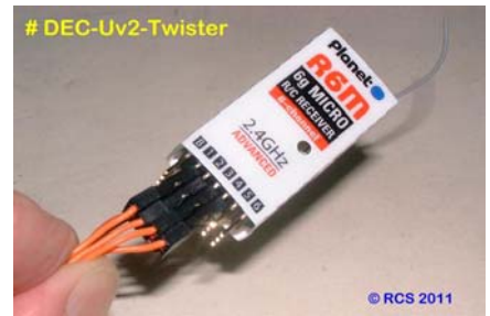
Insert the supplied servo cables into the servo sockets on the # R6M RX. The 3 x wire lead goes to # 1.

Servo terminals for Ch # 5 & Ch # 6 can be used by accessory servos. Proportional or momentary action OK.