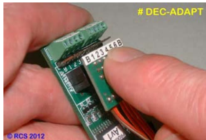
Then gently press the pcb into the sockets.