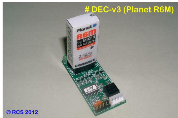
Then gently press onto socket. The fit will be tight. Do not force.

The BATTERY terminals must NOT be connected.