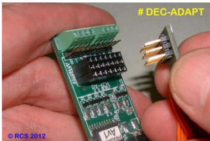
Carefully align pins 1 – 6 of the small # DEC-ADPT kit pcb with the sockets marked 1 – 6.

Mounting the RX at right angles to the # DEC-v3 pcb may not be convenient. In this case it will be necessary to separately purchase the # DEC-ADAPT kit with individual servo leads. This permits remote mounting of the RX.