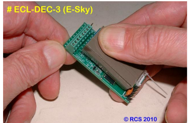
Then gently press onto socket. A tightish fit. Do not force. Use a dab of silicone adhesive to reinforce the antenna.

The BATTERY terminals must NOT be connected.