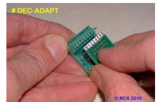
Then gently press onto socket.