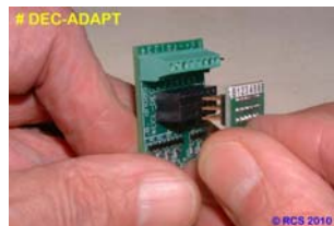
Carefully line up the pins on # DEC-ADAPT with the pins # 1 - 6 on # ECL-DEC .