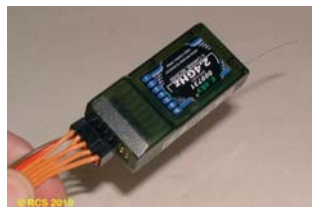
Insert the supplied servo cables into the servo sockets on the RX. 3 x wire lead to # 1.