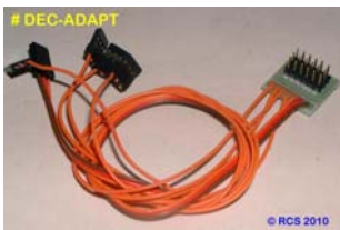
The # DEC-ADPT kit. (Prototype kit shown).

The # 731 RX cannot fit at right angles on the # ECL-DEC . In this case it will be necessary to separately purchase the # DEC-ADPT kit with individual servo leads. This permits remote mounting of the RX.