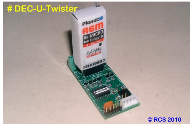
Then gently press onto socket. The fit will be tight. Do not force.

The BATTERY terminals must NOT be connected.