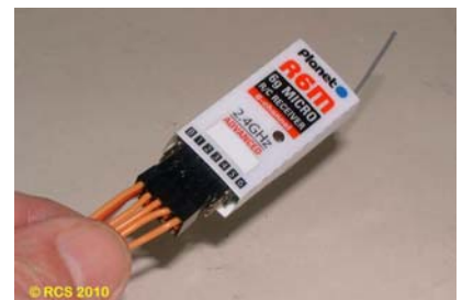
Insert the supplied servo cables into the servo sockets on the # R6M RX. The 3 x wire lead goes to # 1.