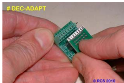
Then gently press the pcb into the sockets.