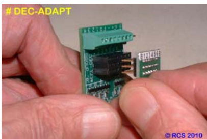
Carefully align pins 1 – 6 of the small # DEC-ADPT kit pcb with the sockets marked 1 – 6.

Mounting the RX at right angles to the # ECL-DEC pcb may not be convenient. In this case it will be necessary to separately purchase the # DEC-ADPT kit with individual servo leads. This permits remote mounting of the RX.