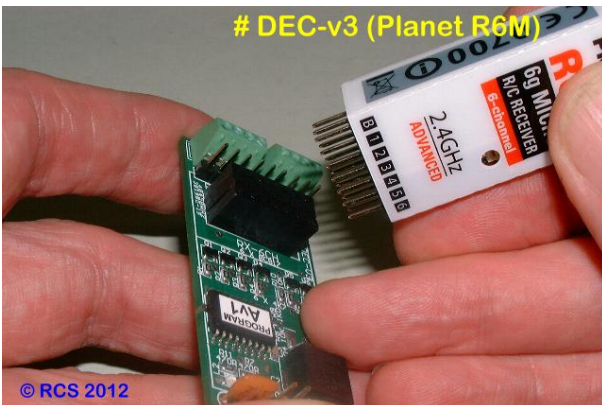
Hold one part in each hand. Carefully line up pins # 1 – 6.

This new operating program allows you to use 4 or more channel PLANET 2.4 Ghz RX's. Some plug in at right angles. The # DEC-v3 provides a 5 volt BEC supply for the 5 channel R6M 2.4 GHz RX. You do not need batteries for the RX.