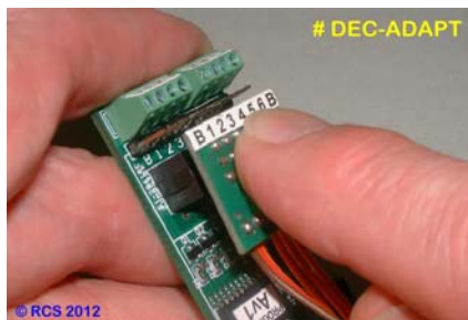
Then gently press the pcb into the sockets.