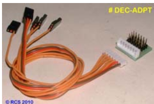
The # DEC-ADPT kit. (Prototype kit shown).

The # 731 RX cannot fit at right angles on the # ECL-DEC . In this case it will be necessary to separately purchase the # DEC-ADPT kit with individual servo leads. This permits remote mounting of the RX.