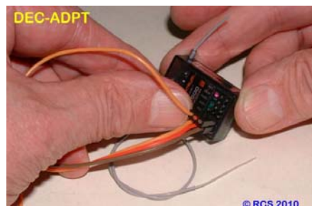
Insert the 1 x 3 way servo cable & four single wire cables into the TR6a RX. The 3 x wire cable goes to # 1 servo output.