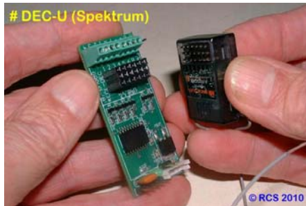
Hold one part in each hand. Carefully line up pins # 1 – 6.

The # DEC-U provides a 5 volt BEC supply for the 6 channel AR500 2.4 GHz RX. The RX does not need batteries