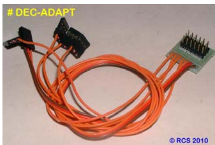
The # DEC-ADPT kit.

Alternately, the separately sold # DEC-ADAPT kit permits the RX to be mounted anywhere you wish. With the addition of the # BINDER , this kit will also enable you to have an "at will" BINDING capability to hand over locos to a different TX. EG. Adding & removing speed matched locos to a train. See page # 6 3.1 & 3.2. Speed matching.