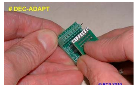
Carefully line up the # DEC-ADAPT pcb with pin #'s 1 - 6 on the # ECL-DEC & gently press it home onto the sockets.